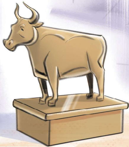
Image of Gold | Only one of the silhouettes here has the same details as the golden calf. Can you tell which and spot the differences in the others?